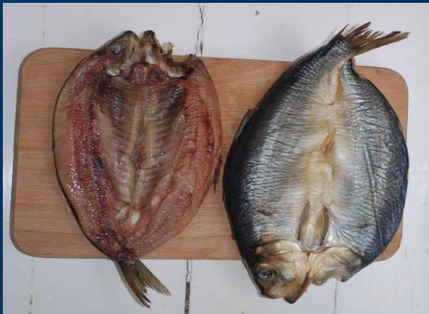
← KIPPERS →

You may also come across strongly flavored kippers (cold smoked herring) served for breakfast. Once the quintessential British breakfast food in the Victorian and Edwardian eras, kippers are now enjoying a revival.